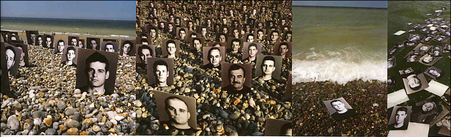
Jubilee (Dieppe) installation views 2002